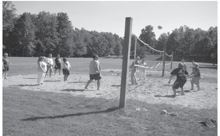
tie-breakers but more from the joy of playing the game. The m o s t enjoyable part