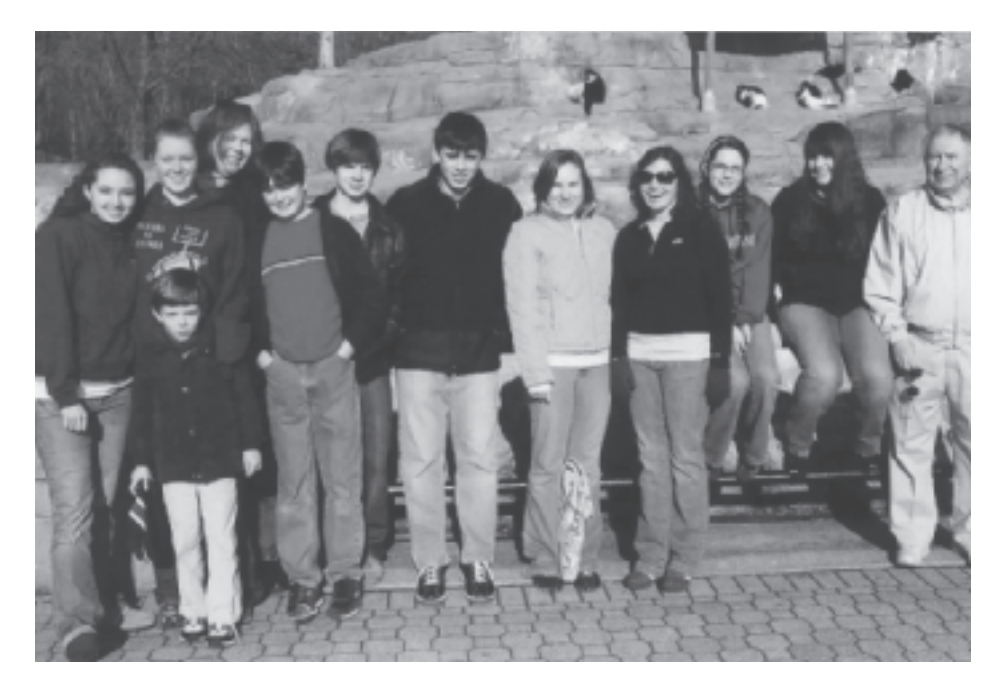
Jr. UOL Members Visit the Cleveland Zoo

One of the most exciting events of the past two months was December Days at the Zoo. Many of the juniors, and even a junior from Carnegie, went to the zoo on a cold, yet cheery day in December. We roamed the zoo and the Rainforest, seeing many animals such as polar bears, monkeys, snakes, various birds, wolves, fish, and even reindeer! Everyone that came had a pleasurable time!