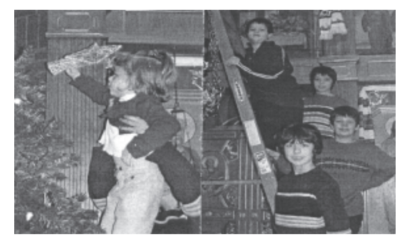
Youngsters helping with the decorating

And just days away from the Nativity of our Lord, children of the parish, with the help of adults, decorate the church for the big celebration. The garlands, the lights, the flowers and the trees are beautifully decorated with colorful embroidery.