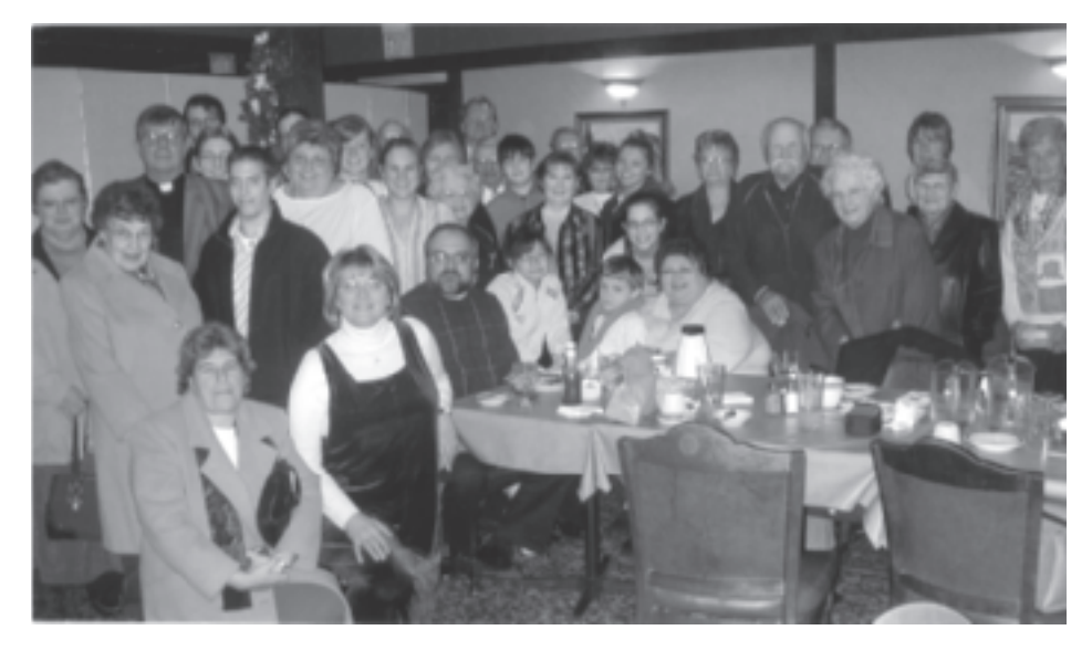
St. Vladimir's UOL Chapter Members Celebrate U.O.L. Sunday

[Offer help and assistance by calling St. Herman's Monastery, 216-961-3806, or write to: P.O. Box 6448, 4410 Franklin Blvd., Cleveland, OH 44101]