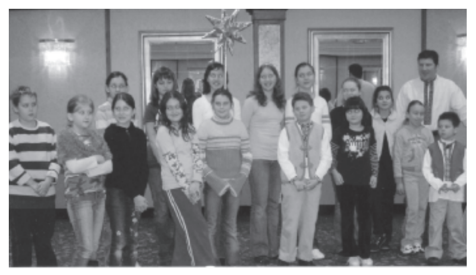
Ukrainian School Students Carol for UOL Executive Board

The UOL Executive Board Meeting, held in Parma, OH on Saturday, January 27th, was pleasantly interrupted by an impromptu presentation of Ukrainian carols by the students of St. Vladimir's Cathedral Ukrainian School. The fifteen students enthusiastically sang several carols to the enjoyment of board members.