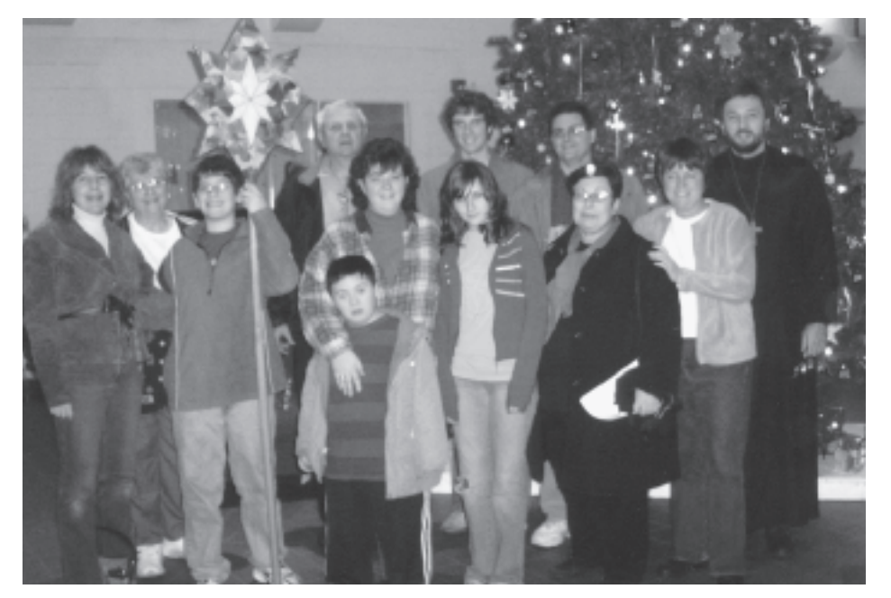
Juniors and Seniors visit the Broome Developmental Center