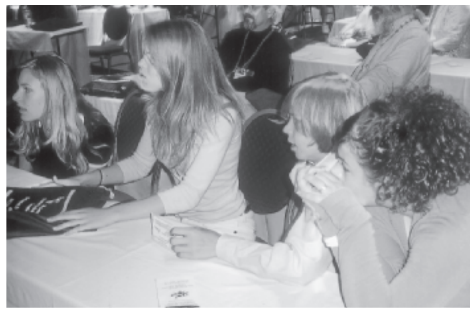
Jr. Business Session

This year, on Wednesday, July 27, 2005, the beautiful city of Northampton and the hospitable members of the Assumption of the Virgin Mary Ukrainian Orthodox Church welcomed the members of the 58th UOL Convention and the 44th Convention of the Jr. UOL. Although no official business sessions commenced immediately, Jr. and Sr. UOL members took care of some of their own personal business by strengthening old friendships and creating new ones as Northampton officially welcomed us at their Hospitality Night. Thursday came, and it was time to buckle down and get to work. After a peaceful Divine Liturgy and delicious brunch, the juniors and seniors broke to begin their first business sessions.