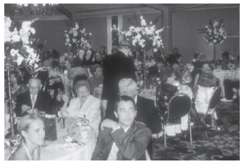
Saturday's Banquet and Ball

After catching a few rays and relaxing in the beautiful weather, preparations for the Banquet and Ball began. Saturday evening was full of emotional speeches, national recognition awards, and awesome dancing to the amazing music of Fata Morgana .