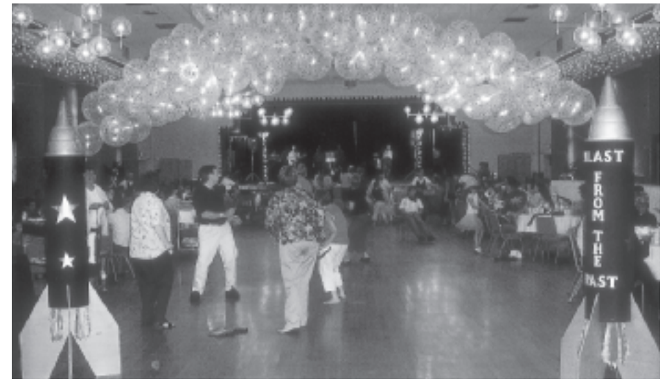
"The Blast From the Past!"

After a fruitful day of sessions, the Convention body embarked on a trip down memory lane to the Northampton Community Center to dance the night away at the "Blast from the Past". Although some of the juniors were, at times, unfamiliar with the music, they kicked off the dancing and got the energy flowing. Soon after, the seniors, inspired by the juniors great dance moves, began to outnumber them on the dance floor to show off some of their own moves. By the smiles and laughter, it was clearly evident that all who attended had a blast from the past, no matter their age!