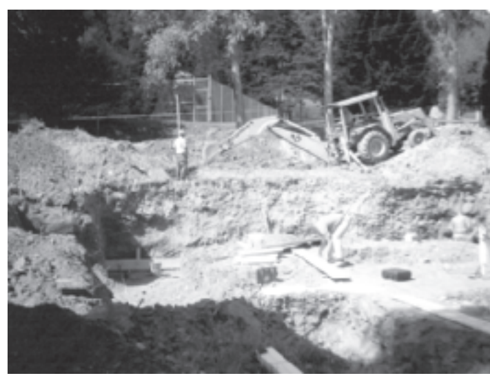
All Saints Chapel Construction Site

DATELINE: August 30, 2005 – Concrete block delivered to the site.