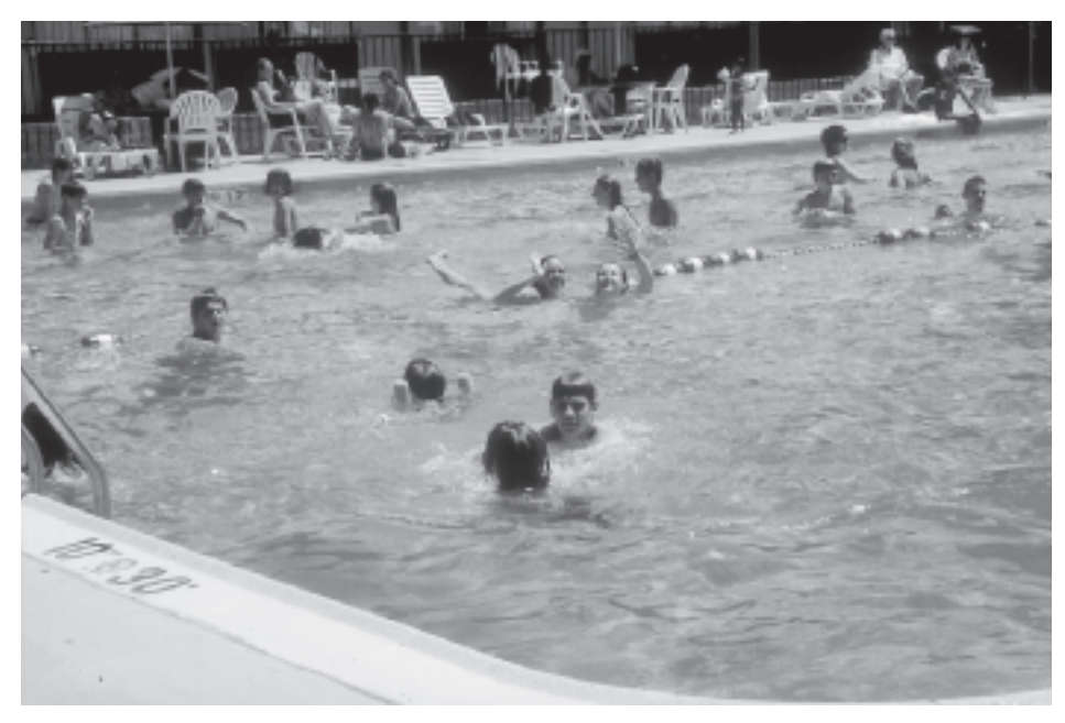
THE "Pool Party" at the Hotel

On Saturday, July 30, 2005, the juniors wrapped up the sessions with the election of the 2005-2006 National Executive Board and celebrated the end of a great, successful convention with a pool party hosted by the Northampton juniors.