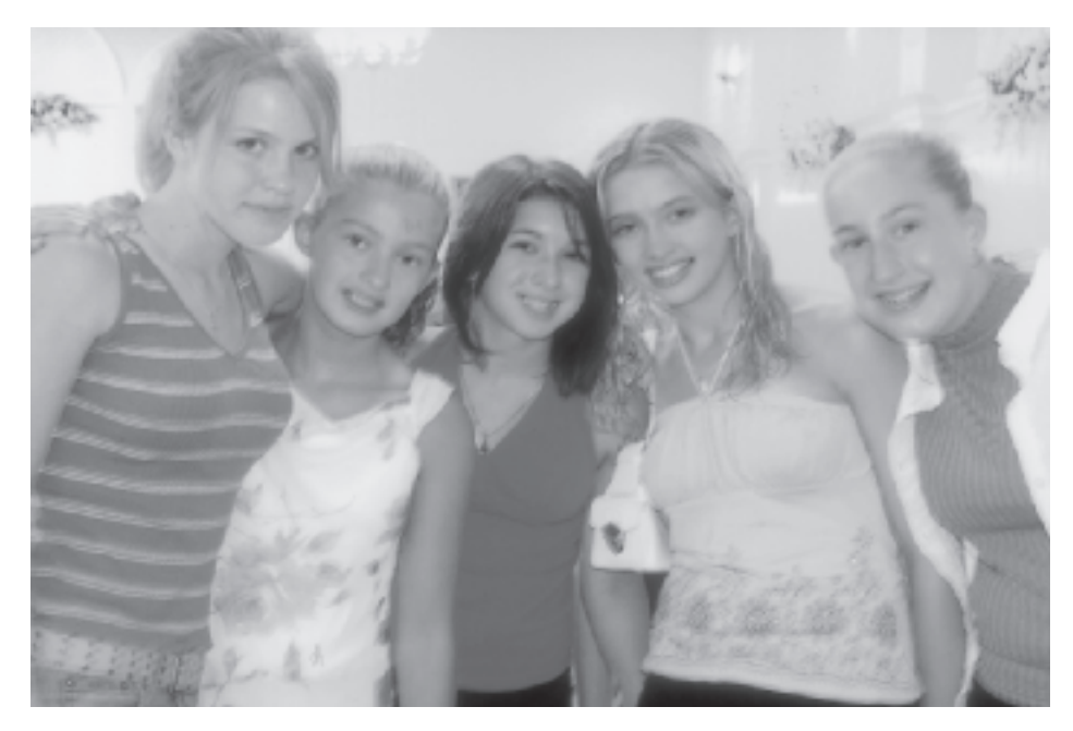
Northampton's "Lovely Ladies"