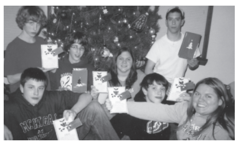
Youngstown Jr. UOL Christmas Party and Work Session

Our visit to the nursing home filled us with joy to see the smiles on the resident's faces. Next, we designed Christmas cards for our troops in Iraq. Knowing that they would be away from their families during the holidays, we sent the cards as a "thank you", and to tell the soldiers that they are missed at home. A miniature candy cane in a paper stocking was sent with each card with the spiritual "Story of the Candy Cane". We also included an "open me" handmade paper snowflake gift that said "a little bit of snow from O-HI-O." These Christmas greetings made our heats feel happy—in the tradition of "It is better to give than to receive."