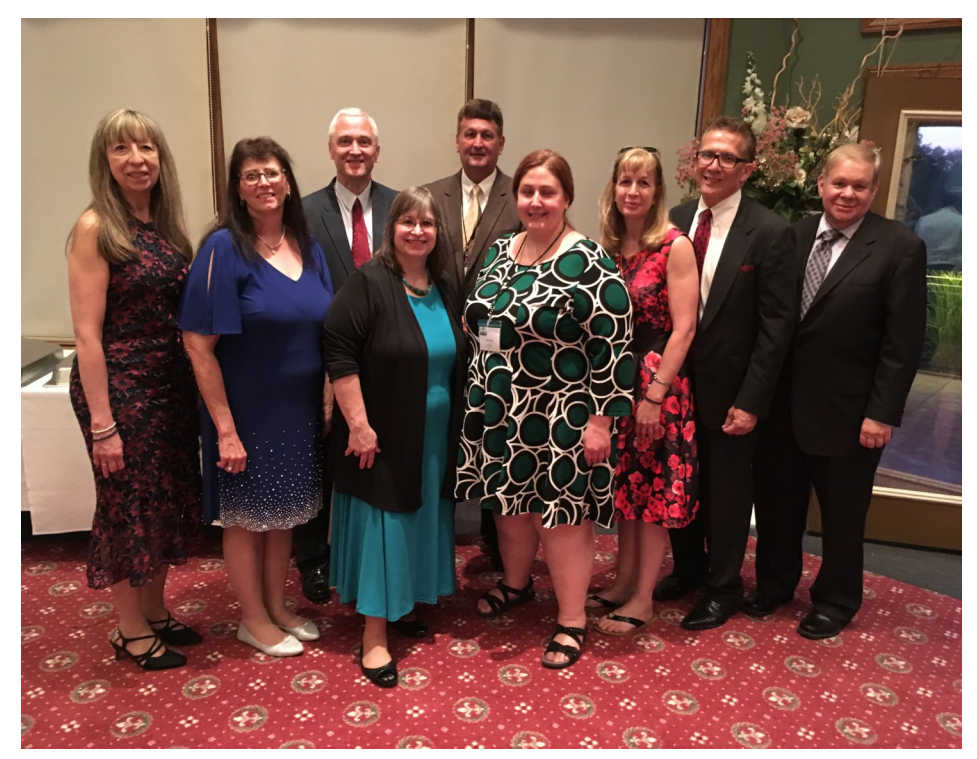
Senior National Executive Board