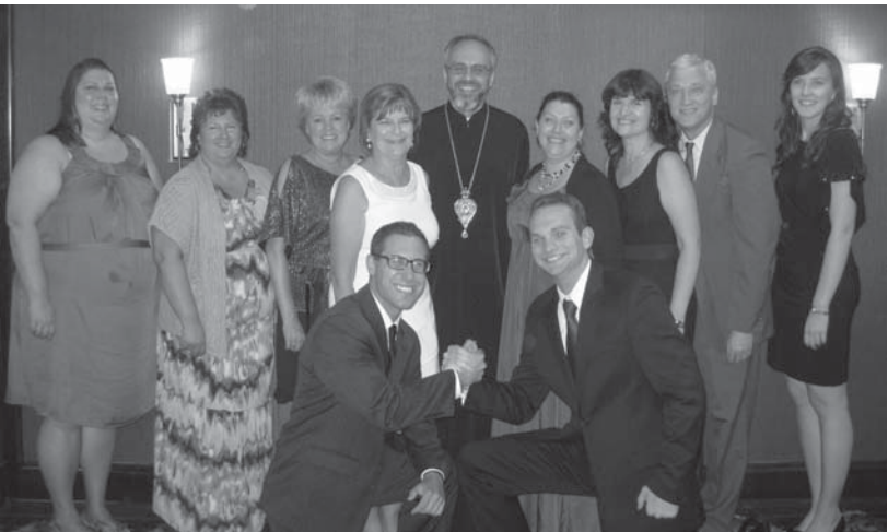
2012-2013 Senior National Executive Board