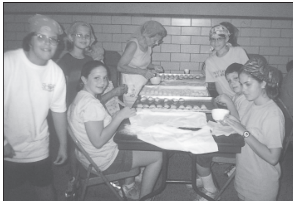
Juniors learning to make potato balls for pierogies