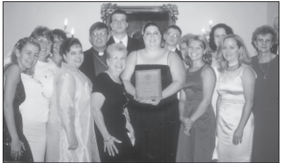
St. Vladimir Sr. UOL Chapter, Parma, OH

The Senior Chapter Achievement Award is presented to the Senior Chapter that has shown the greatest achievement in terms of accomplishing the aims and goals of the UOL during a one year period of time.