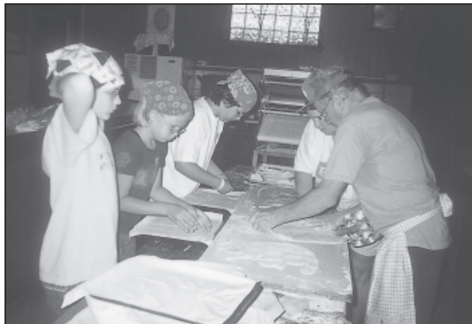
Juniors rolling and cutting dough for pierogies